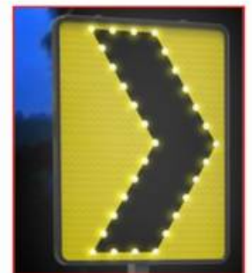
CHEVRON IN LEFT DIRECTION to install in the shoulder divider side.