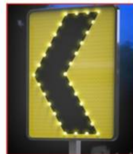
CHEVRON IN RIGHT DIRECTION to install in the side of center lane separator.