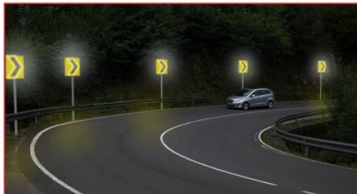
CHEVRON IN RIGHT DIRECTION