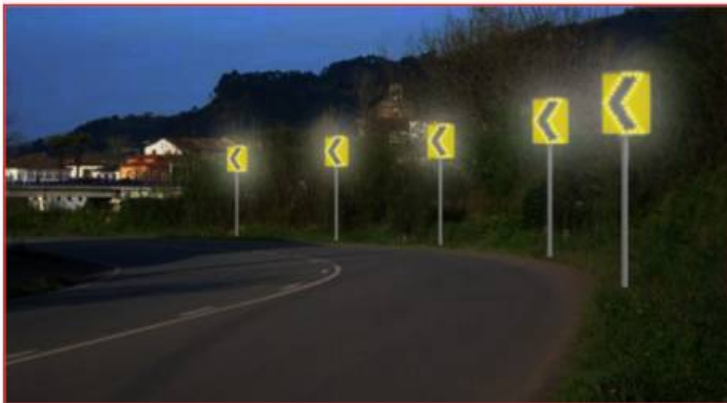
CHEVRON IN LEFT DIRECTION