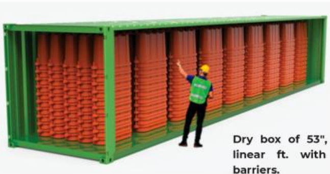
Dry box of 53", channelize up to 6,397 linear ft. with approx. 1,300 nestable barriers.