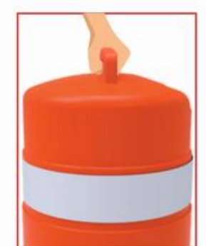
Top grip to manage