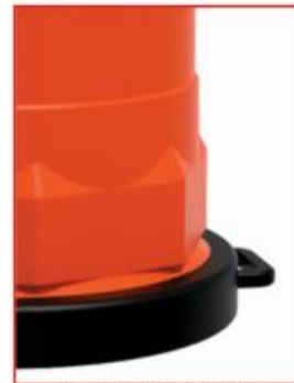
Base with handle