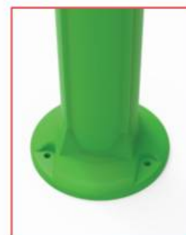
Gussets and boreholes