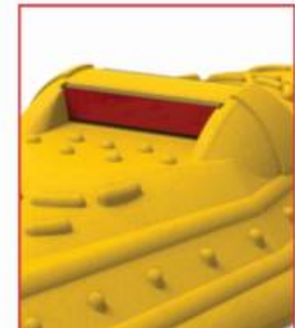
Red reflective sheeting face