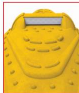
White reflective sheeting face