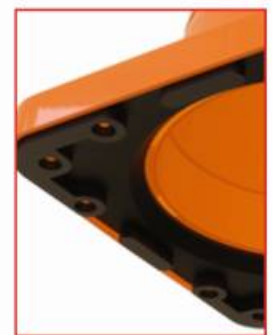
Heavyweight base to balance