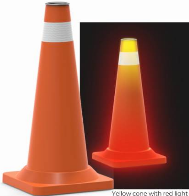
Yellow cone with red light sample

Mainly suggested on work zones, places with road repairs or where is required to sign a danger or detour.