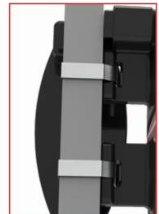
Stainless Steel Strap