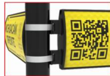
INSTALLATION WITH SLOTS