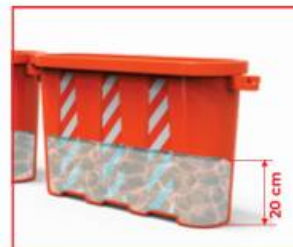
WATER FILLING (maximum of 7.8in)