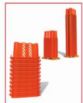
STORE UP TO 99 PCS PER PALLET