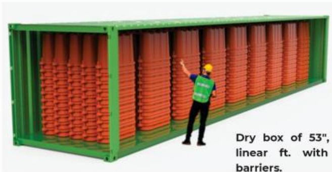
Dry box of 53", channelize up to 6,397 linear ft. with approx. 1,300 nestable barriers.