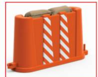
2 SAND BAGS OF 22 LBS EACH (OPTIONAL)