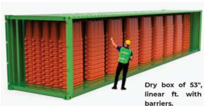
Dry box of 53", channelize up to 6,397 linear ft. with approx. 1,300 nestable barriers.