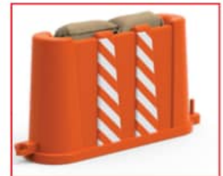
2 SAND BAGS OF 22 LBS EACH (OPTIONAL)