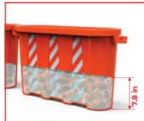
WATER FILLING (maximum of 7.8in)