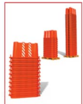
STORE UP TO 75 PCS PER PALLET