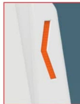
Engraved chevrons in body of barrier