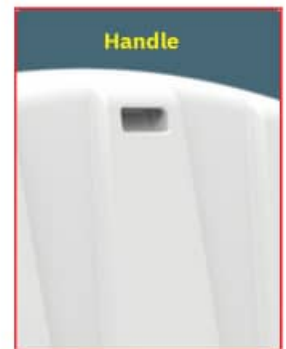
Handle to manage