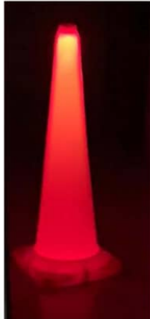
Yellow cone with red light sample