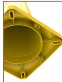
Ends for an stable balance