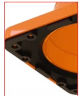
Heavyweight base to balance the cone