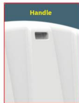
Handle to manage