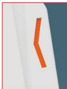
Engraved chevrons in body of barrier