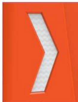
Engraved chevrons in the body of barrier

The nestable barriers represent an efficient, safe, and affordable solution for any signage need or control of urban spaces, road environments, and public spaces.