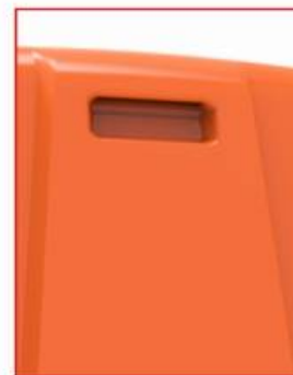
Handle to manage